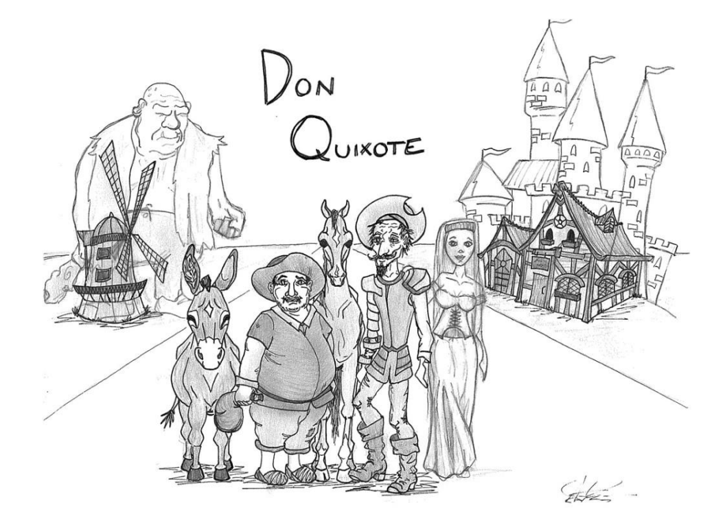
Don Quixote. 8.5" x 11". Ink and graphite on plain paper.