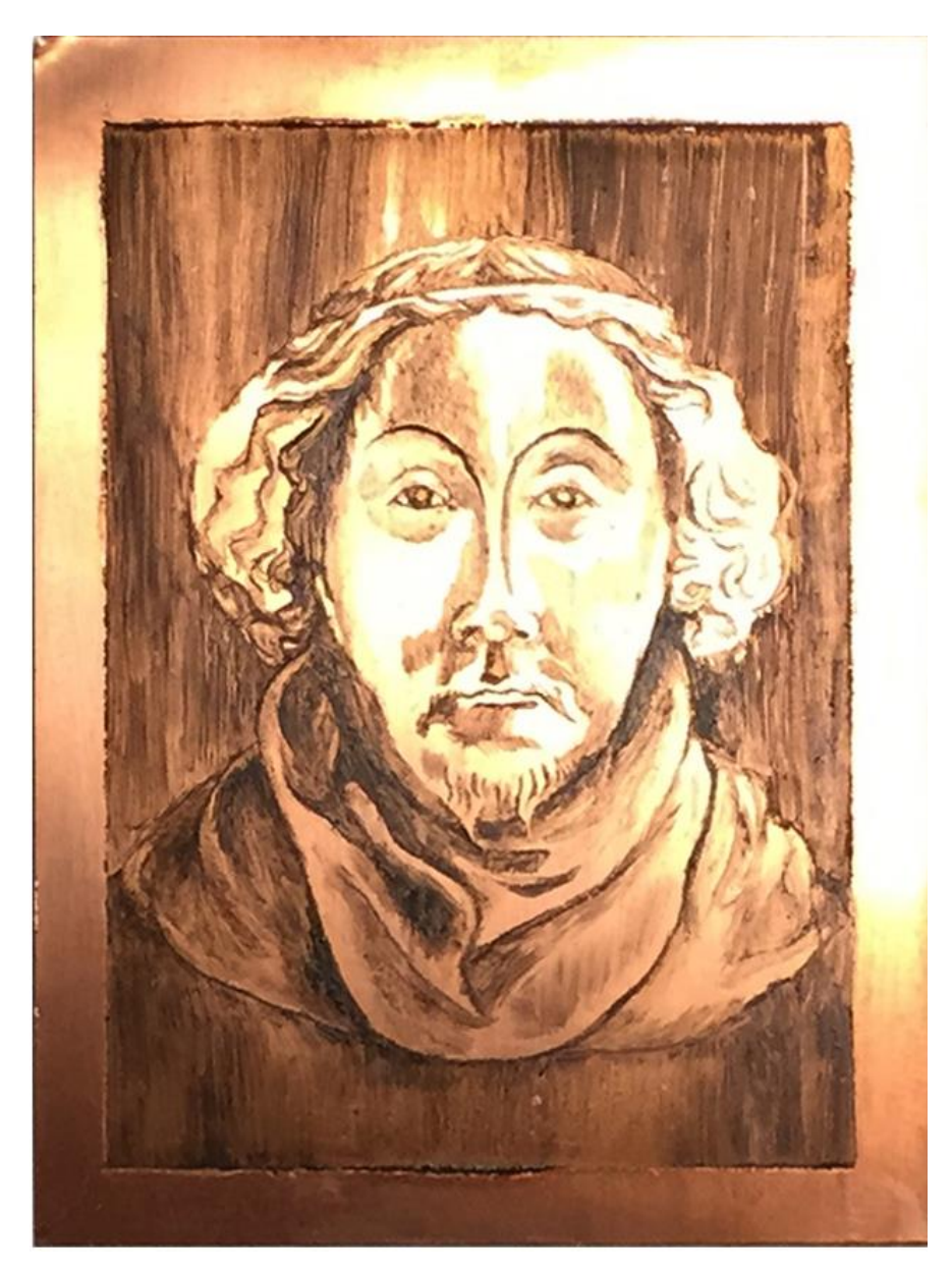
Effigy of Richard II. 3" x 4". Pigment and oil on copper.