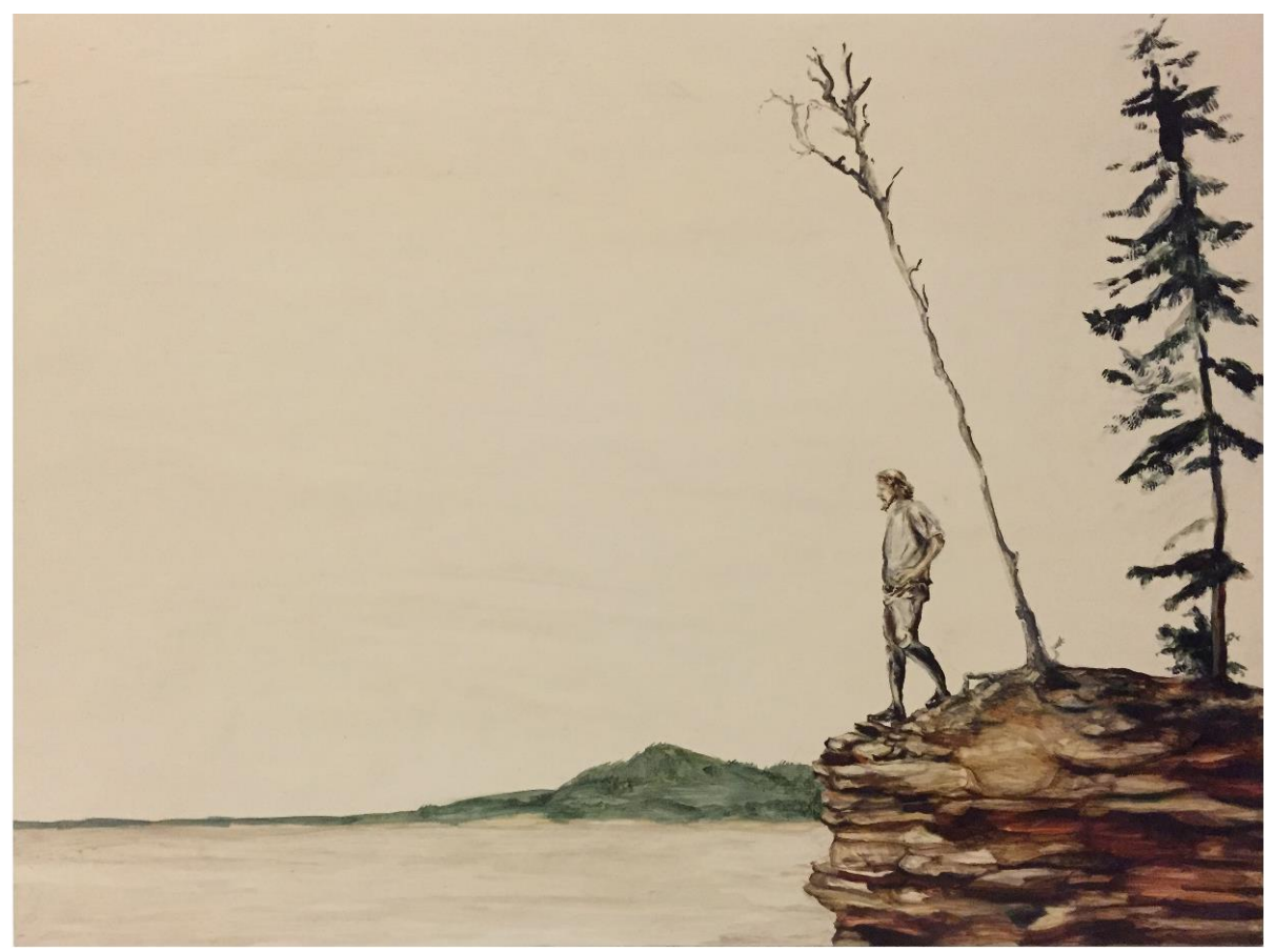
Destruction of Sheen. 11" x 15" x 0.75". Oil on red oak panel.