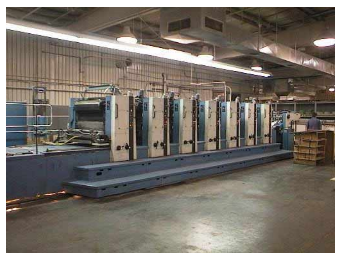
Figure 1. Printing press seen on class tour

distribution system for the building. They work in teams of two and develop a set of design documents for the building. At the end of the term, the team presents their design to the rest of the class. The building for the 2000-2001 school year was a print shop. As part of the course, the class toured a local print shop. A digital photo taken by one of the students during the tour is shown in Figure 1. The class also toured local transformer and switchgear manufacturers.