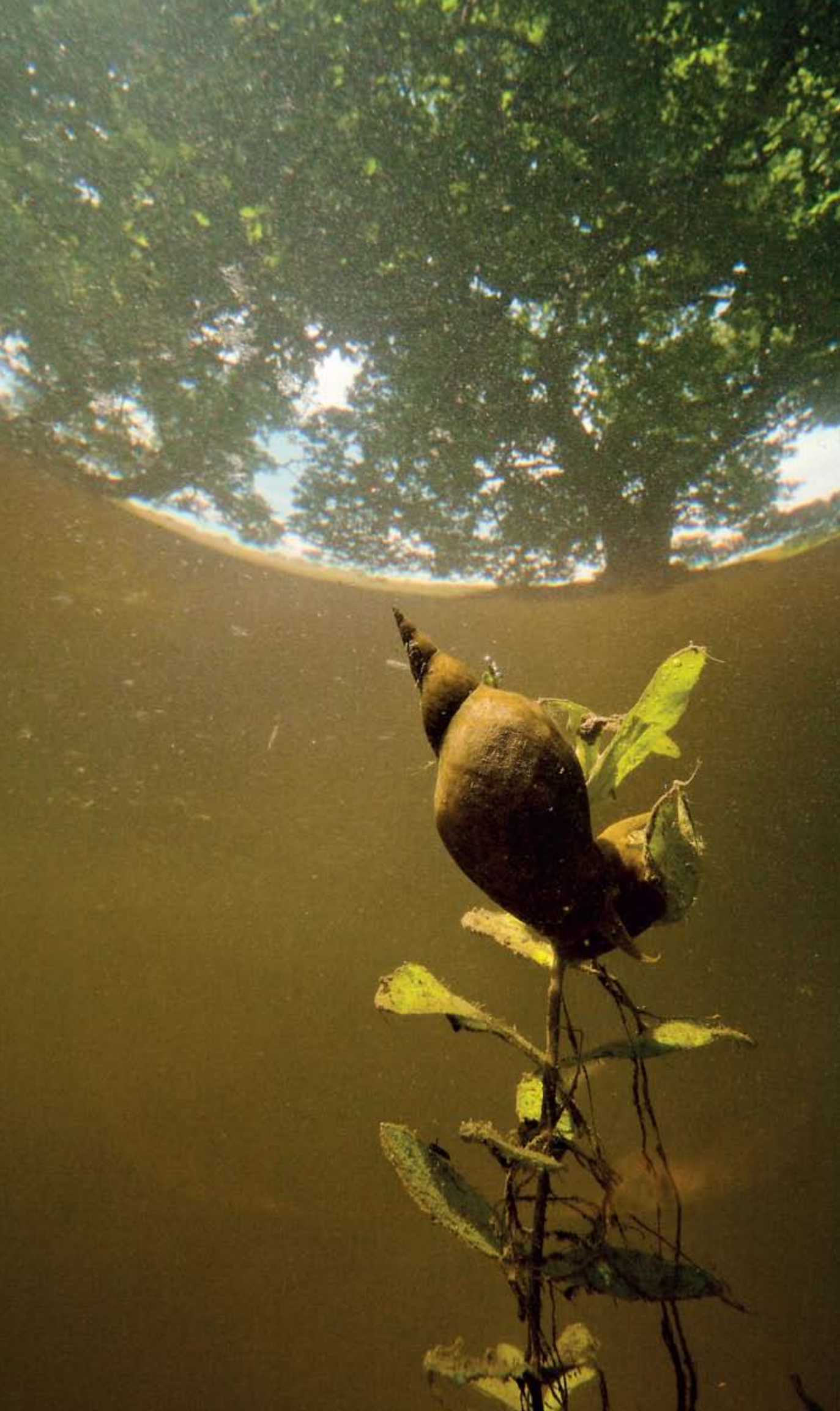
Left: Great pond snail ( Lymnaea stagnalis ) in a hardwood forest pond at Gornje Podunavlje Ramsar site, Serbia. This species serves as host to the larvae of a number of cryptic species of flatworm.

mix of anatomical, biogeographic, and molecular analyses is often required to distinguish these cryptic species. Bain et al. (2003) used these techniques to identify six additional cryptic species of cascade frog from Southeast Asia that had previously been conflated as a single species.