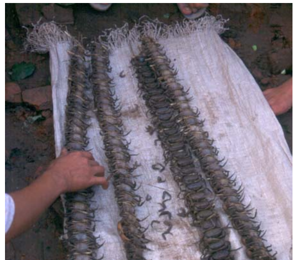
Fig. 4 Freshwater crabs ( Somanniathelphusa dangi : Parathelphusidae) being sold as food in a rural market in northern Vietnam

One of the key processes driving freshwater crab diversification is likely to be allopatric speciation resulting from geographic isolation. This is helped by the relatively low fecundity and poor dispersal abilities of freshwater crabs; and is often facilitated by the habitat heterogeneity and numerous ecological niches and microhabitats afforded by the complicated topography and hydrology of their