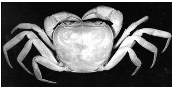
Fig. 1 Habitus

l Total—29 genera with various overlapping distributions (see above for details)