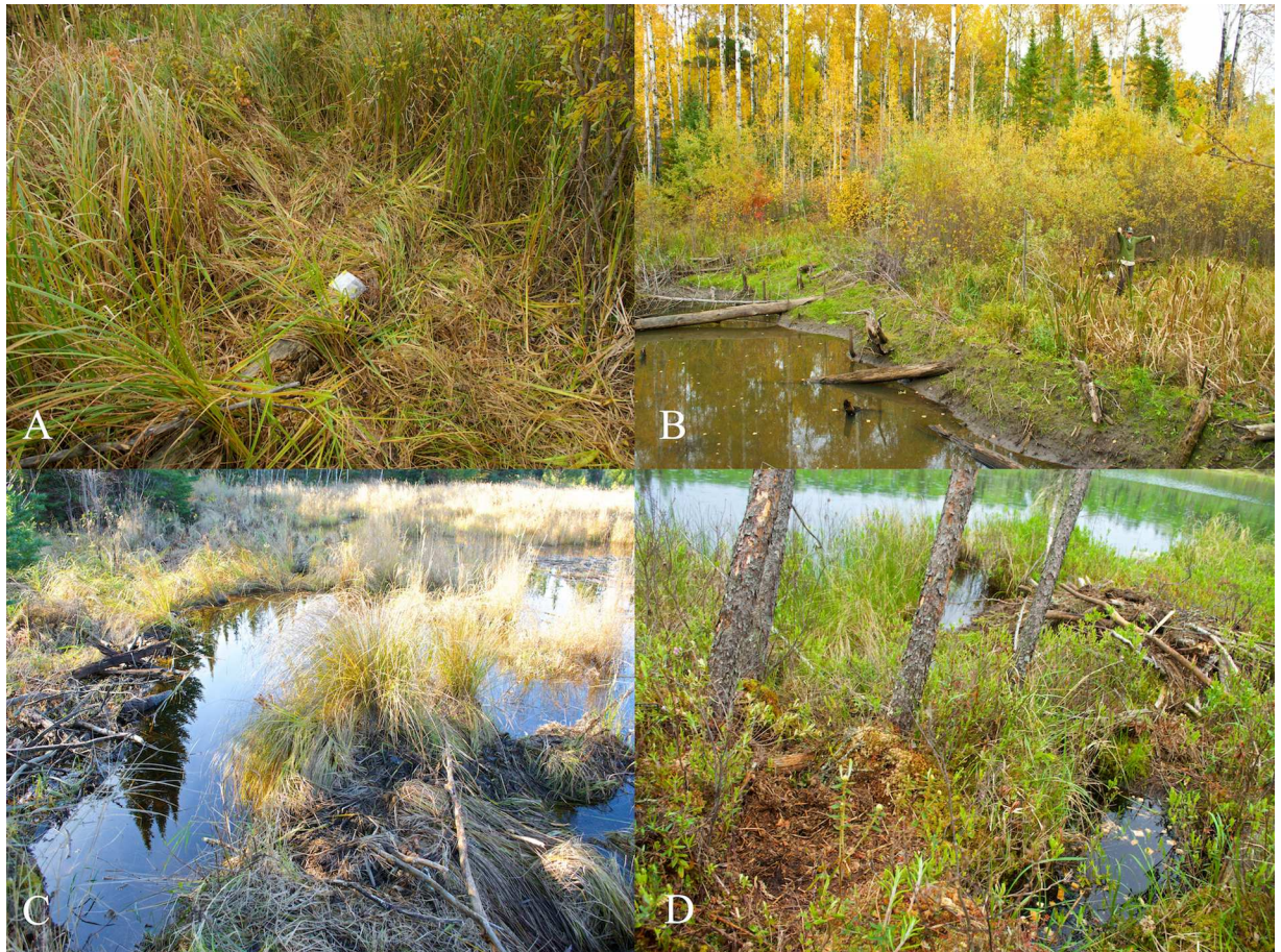
Fig 2. Examples of evidence found at beaver kill sites (A,B,C), and of wolf behavior when in active beaver habitats (D) in Voyageurs National Park 2015. A) Matted vegetation at kill sites provided important information about how wolves killed beavers. B) Co-author Homkes stands at Beaver Kill Site 13 <10 m below an active beaver dam. C) Beaver Kill Site 18 on a small point <5 m from the active dam where a wolf, based on the trampled vegetation, presumably pulled a kit beaver out of the water and consumed it. D) A wolf bed (lower left corner) found when examining clusters of GPS-locations in the spring. The wolf bedded for \geq 4 hr next to this active beaver lodge without making a kill.