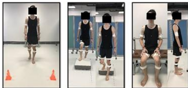
Figure 2: overview of lower limb conditions. From left to right: walking gait, step up and down, sit to stand.

METHODS: Data related to A single male patient (height: 166 cm, weight: 68 kg, age: 63) who presented with medial compartment left knee pain was collected at the Biomechanics Laboratory in Rehabilitation Research Institute of Singapore. The patient's lower limb biomechanics were assessed using three different conditions: 1) walking gait, 2) step up and down 3) sit to stand task (Figure 1). Only the results of walking gait trials ( n = 7 ) were reported in this study.