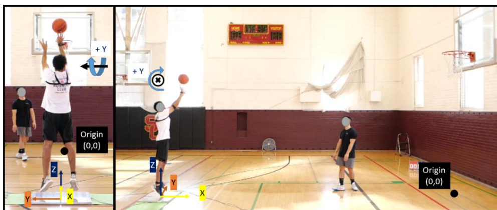
Figure 1 The gym reference system. The origin (0, 0) is located on the floor directly beneath the center of the hoop. Positive x is in the direction of the hoop. Positive y is in the direction to the left of the hoop from the shooter’s perspective. Positive z is up. Positive angular velocity about the y-axis is clockwise.

Segment angular velocities were rotated from the local reference system into the gym reference system (Figure 1). Net vertical impulse was calculated from the initial static position (CM ~ 0 velocity) to last contact with the ground. The body CM vertical velocity at release was calculated using the net vertical impulse and the time in the air prior to ball release. Coordination between upper extremity kinematics and CM vertical velocity generation during the shot was characterized by plotting CM vertical velocity, upper arm angular velocity, and forearm angular velocity during shot preparation and last push on the ball phases (Figure 2). Only successful shots were used in the analyses (median number of shots per participant: 7.5).